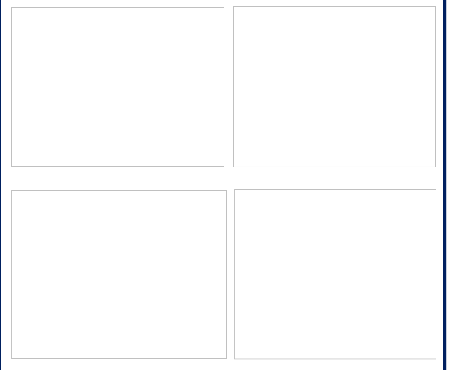
corrugated concrete deck form